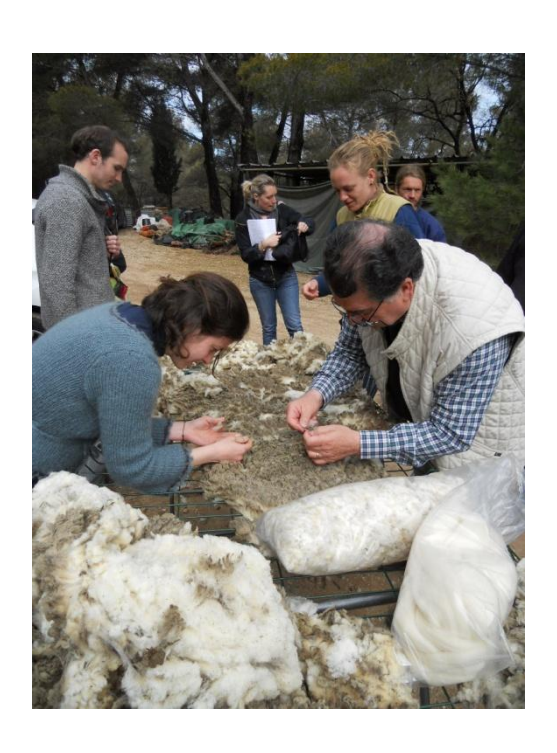
Professionnal training courses for shearing, wool grading, wool handicrafts